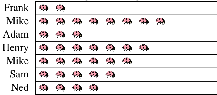
Bug Catching Contest

Tom and his friends were trying to see who could catch the most bugs in a day. They recorded their information in the pictograph below.